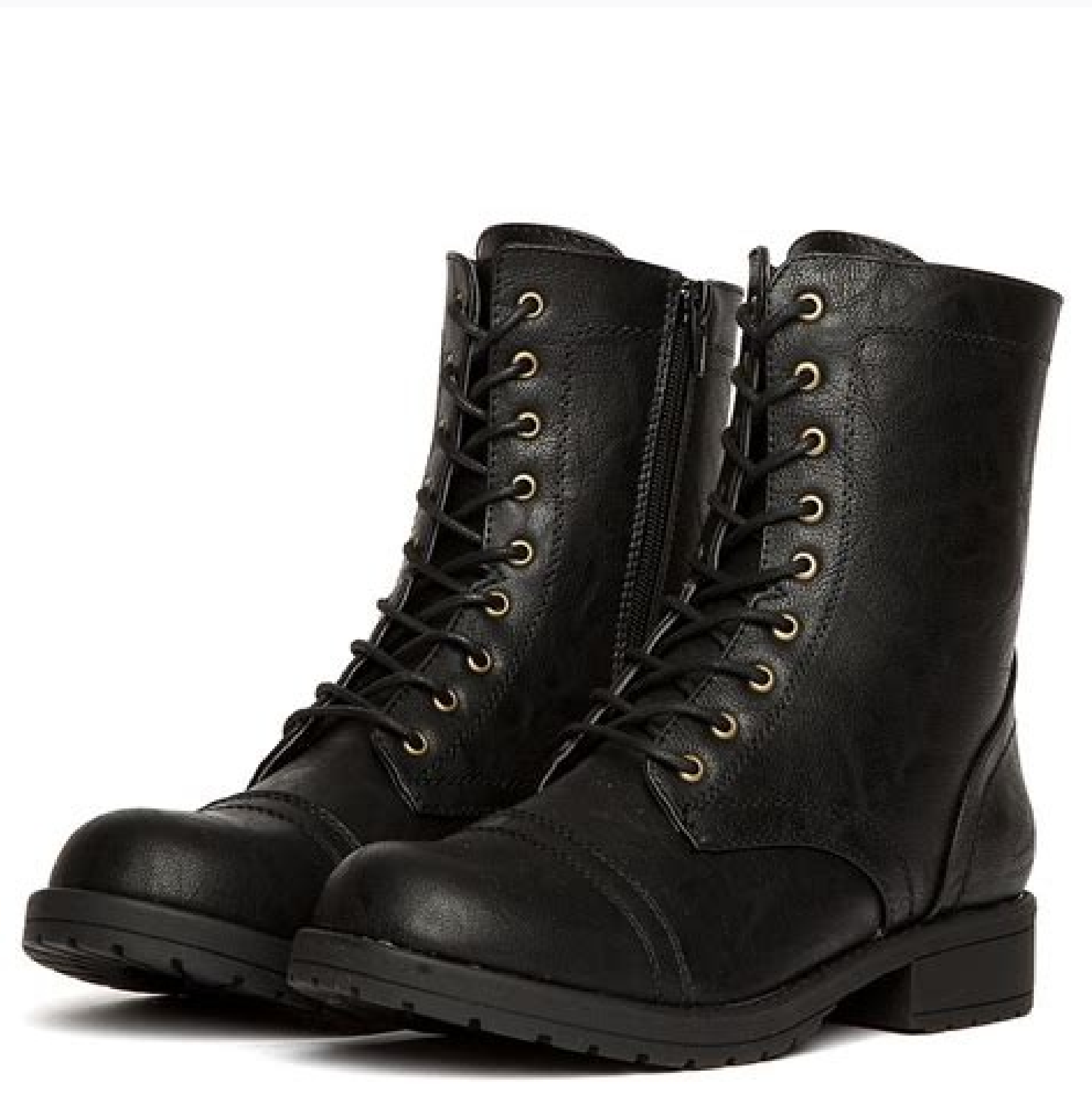
Knee high boots price in nepal. Boots nepal.

Create your return, scan your Code QR and enter one of the Armados - available 24/7! Sorry, we find no product that corresponds to the selected filters. The returns from Boohoo UK are free and fancies! We have no role, you can return through our deponent portal here. Find something memorable, join a community doing good. By hygiene reasons, we can not offer reimbursements about fashion facial, cosmetic, perforated, swimwear or lingerie, if the seal has been broken or more in place. Good notion! Now we offer a passage of return without a chapter with instant returns in the armies at the post. You have 28 days, since the day you receive it, to send something back. Bei alieexpress.com Willkommen well -vowing back Abmelden Registrieren anmelden ä € SKIP TO MAIN CONTENTYOUR BROWSER NAM IS SUPPORTED TO USE ASOS, we recommend using the latest versions of Chrome, Firefox, Safari or EdgeMarketPlacehelp & Faqsavailable in the Play Store © 2022 Asosprivacy & Cookies & Csaccessibility Update the most recent version. ETSY is not more supporting older versions of your web browser to ensure that the data of the enjoyment is safe.